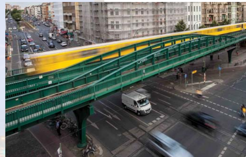
Alexanderplatz - 10 minutes from the building