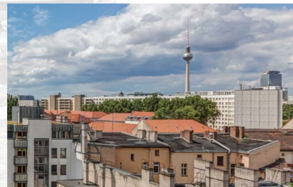
Volkspark Friedrichshain - opposite the building